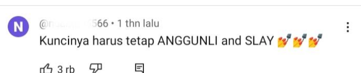
Picture 11 Use slang on YouTube

"Gotcha" is a contraction of "Got you" or "I've got you." Often used when someone has been caught doing something, especially in a playful or teasing manner.